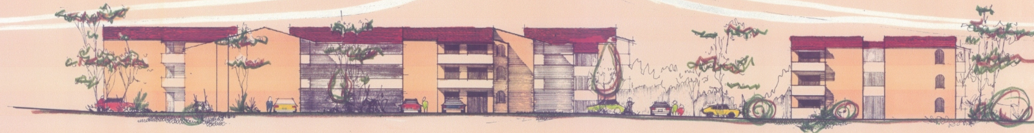
SOUTH ELEVATION 1:200